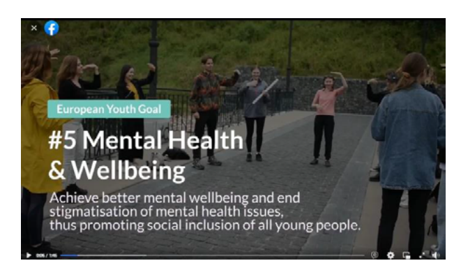
Content 1 - Mental health and wellbeing #5 Mental health and wellbeing

Due to poor mental health and high levels of anxiety among youth,we raised the recommendation to introduce peer-led mental health services available in schools, colleges or other youth services across Europe. The goal would be to provide more immediate support while reducing